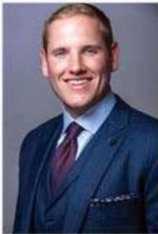
Spencer Stone: Paris Hero