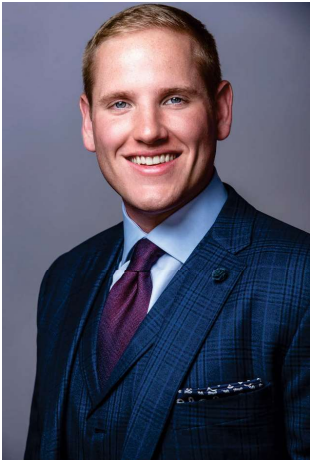
Spencer Stone: Paris Hero